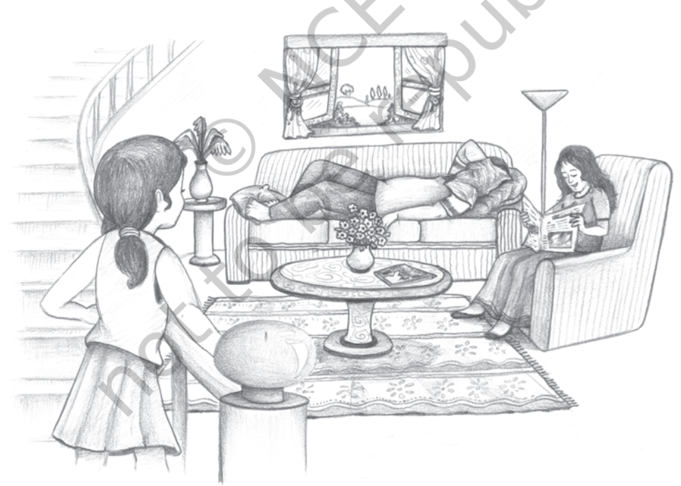
The little girl always found Mother reading and Father stretched out on the sofa.

on the brink of suicide: about to commit suicide