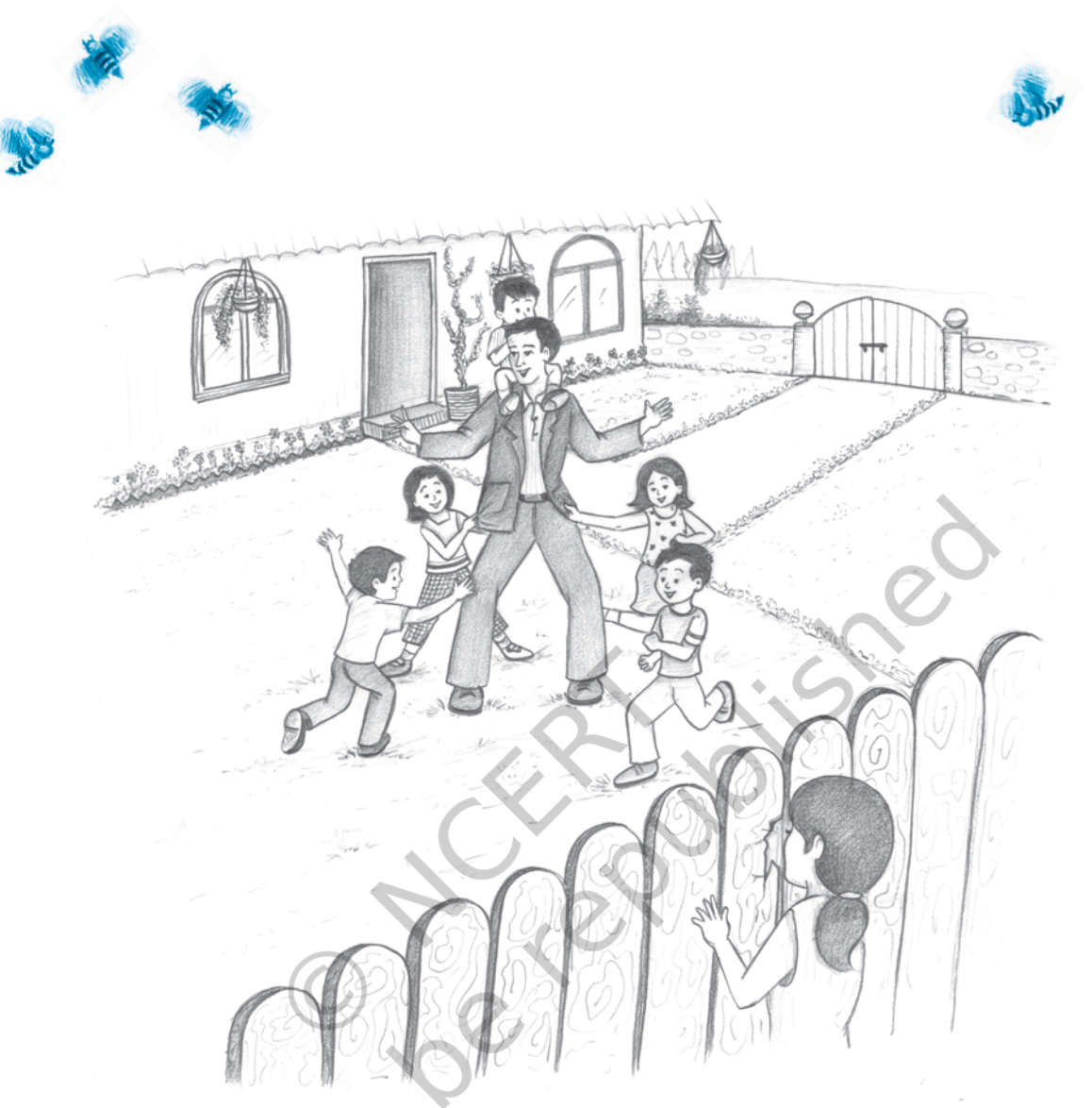
The little girl saw through a gap the Macdonalds playing 'tag' in the evening.

but while Alice was putting her to bed she grew suddenly afraid.